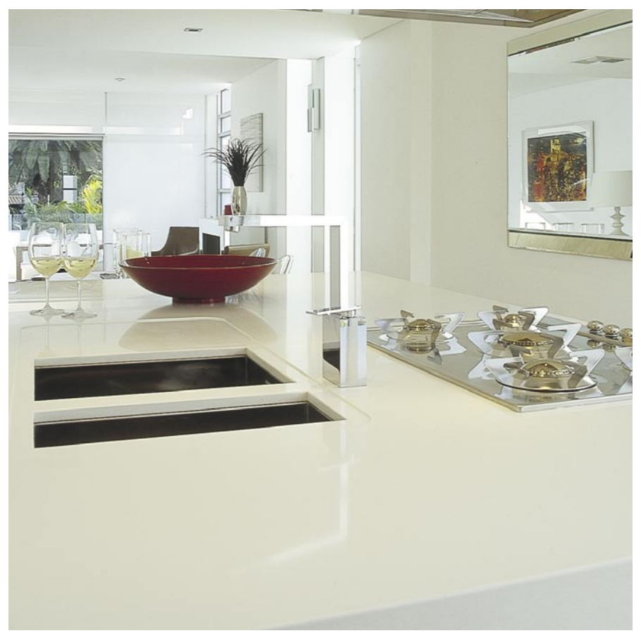
Kitchen bench top in Snow 2141

CaesarStone's unique Australian colour range has been developed to co ordinate with a wide range of materials. The entire CaesarStone® colour range is offered in polished slabs and a selected range in the new Viento texture.