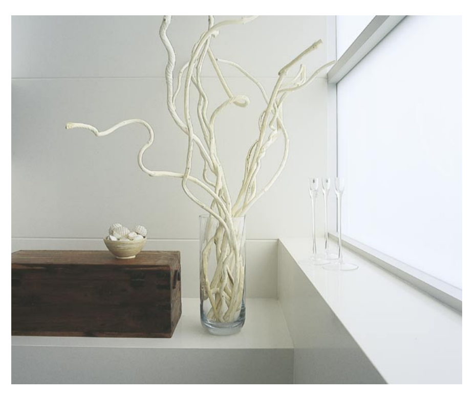
Wall linings and window sill in Snow 2141

Caesarstone®'s unique blend of aesthetic and functional qualities make it the perfect choice for bench tops, table tops, counters and bathroom wall linings. CaesarStone® can be used for splashbacks in accordance to the relevant Australian Standards.